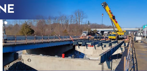
Widening Bridges for Added Travel Lane

It's the second year of construction along this 8-mile corridor. Pavement is being replaced and improvements are being made to 21 bridges, including widening the bridges. Crews are building an added travel lane in the existing median. When complete, this portion of I-70 will include three lanes in each direction.